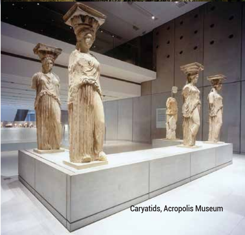
Caryatids, Acropolis Museum