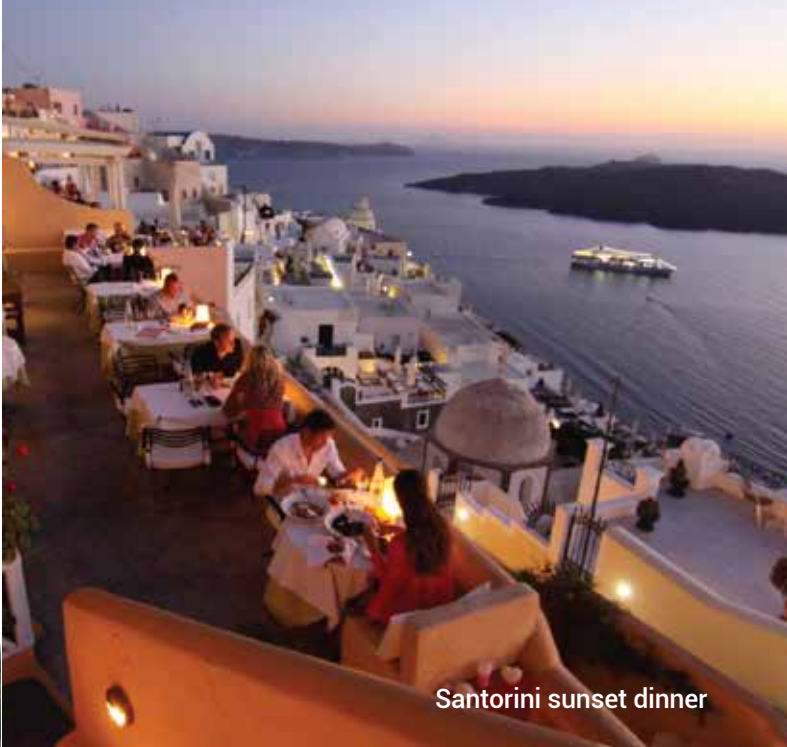
Santorini sunset dinner